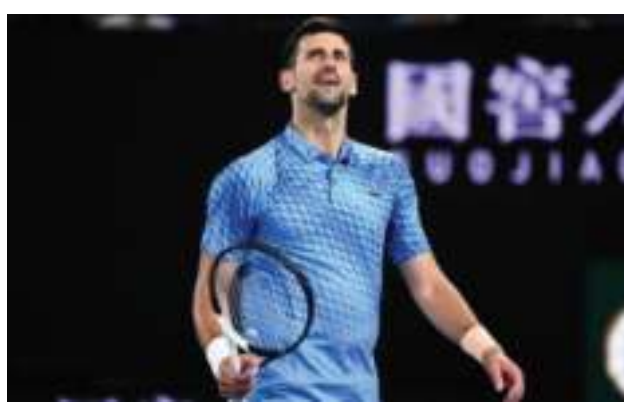
Novak Djokovic

Ezinne Kalu led the way for Nigeria, producing 19 points to go along with five rebounds and five assists