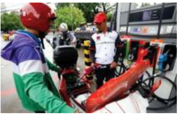
GAS UP. A gas station attendant fills up a motorcycle fuel tank in Paco, Manila on Monday (July 29, 2024). Local pump prices are set to decrease by less than PHP1 on Tuesday morning (July 30).

fell last week due to worries about demand from China, the world's largest crude importer, and as concerns about an escalation of the conflict between Iran and Israel eased.