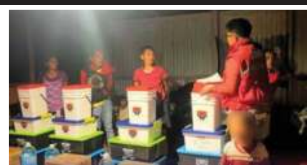
AID DISTRIBUTION. Personnel of the Department of Social Welfare and Development (DSWD) distribute assistance to the victims of Super Typhoon Carina and enhanced southwest monsoon in this undated photo. The DSWD on Monday (July 29, 2024) said distributed humanitarian aid has reached the PHP200-million mark.