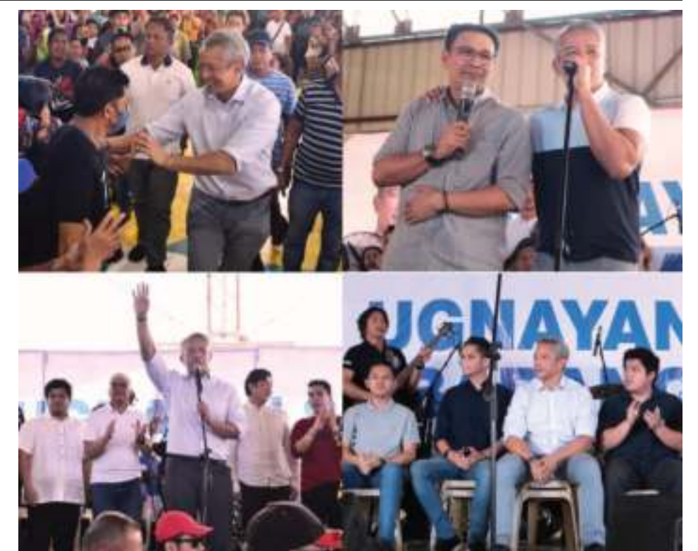
Ugnayan sa Barangay Program Strengthens Community Bonds Across Cavite.

In a series of events aimed at strengthening community ties and fostering open communication between local government officials and residents, Governor Jonvic C. Remulla spearheaded the Ugnayan sa Barangay program across various municipalities in Cavite.