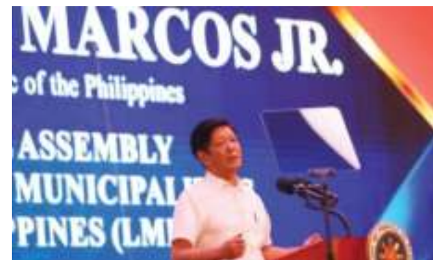
President Ferdinand R. Marcos Jr.

branded the program as a huge push in the ongoing nationwide implementation of the President's flagship Pambansang Pabahay para sa Pilipino (4PH)