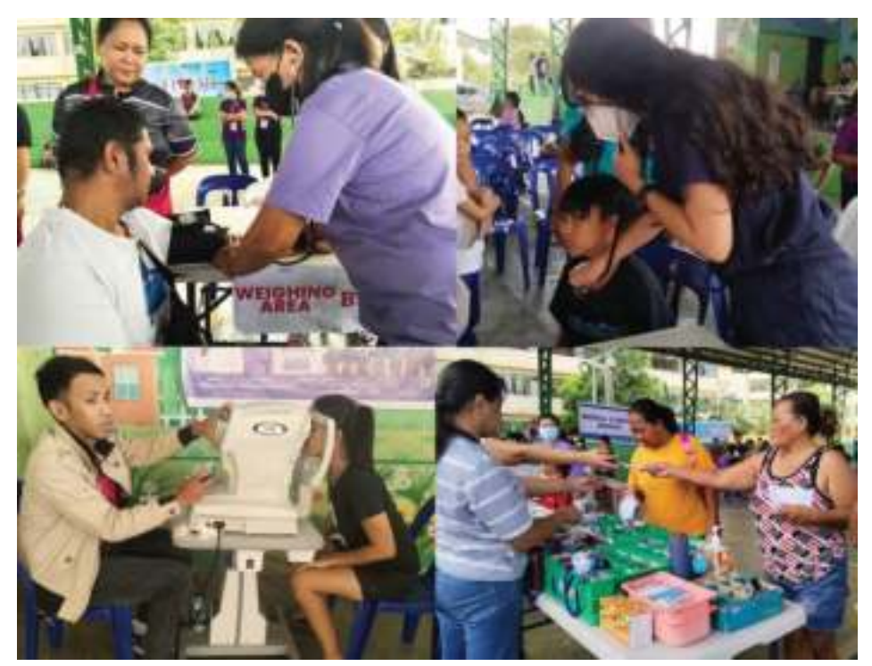
PGCs Health Outreach Program Touches Lives in Barangay Hugo Perez, Trece Martires City.

Cavite Provincial Government's health outreach program held recently, at Golden Horizon Subdivision covered court in Barangay Hugo Perez, Trece Martires City was a resounding success serving total of 560 beneficiaries with vital medical services and supplies.