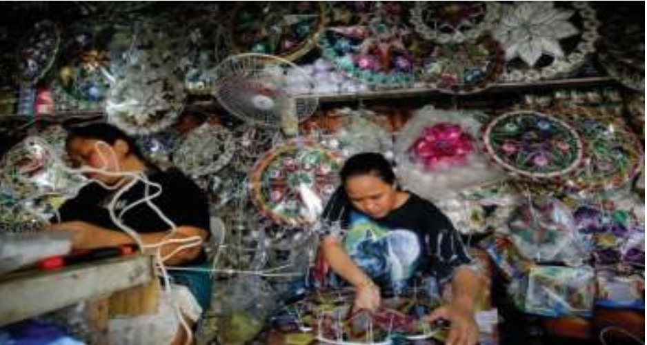
EMPOWERING WOMEN. Women workers install LED lights in lanterns made of capiz shells at a stall in Quiapo, Manila in this Oct. 8, 2023 photo. President Ferdinand R. Marcos Jr. on Tuesday (March 12, 2024) called on member-states of the 68th session of the Commission on the Status of Women to pursue innovative solutions to ensure equal and full participation of women in society.