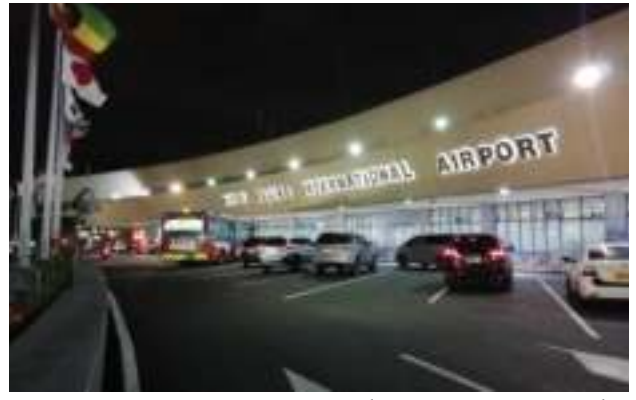
Ninoy Aquino International Airport Terminal 1

"We remind the passengers to check the OTS prohibited items