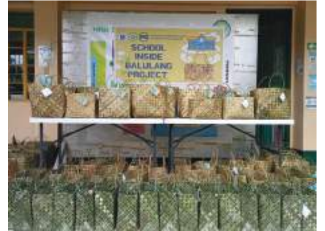
Handicrafts made of pandan are called 'balulang' or 'bayong', sambalilo and 'banig' or mat which is done within 20 minutes depending on the size with price ranging from 20 to 30 pesos.

can extend Project Pandan," he explained.