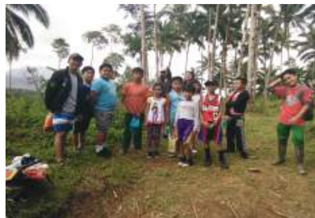
Students in San Isidro Elementary School visits main pandan plantation for their community immersion to witness the process on how pandan handicrafts are made.

"It started as an advocacy of the Supreme Student Council of