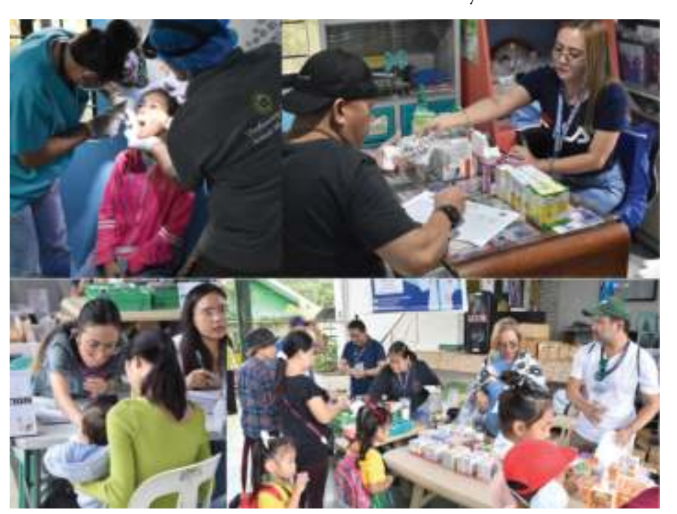
PGC extends health outreach program to the locals of Amadeo.

The success of the mission would not have been possible without the collaboration and coordination of various stakeholders, including local officials, and volunteers. Their collective efforts made it possible to create a positive impact on the lives of hundreds of individuals within the community.---OPIO