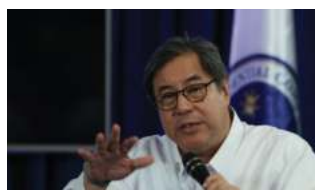
Health Secretary Teodoro Herbosa

and deaths due to cancer and tuberculosis happen when patients have limited access to medicines that help control these diseases.