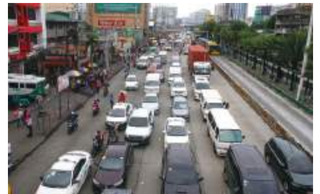
HIGHER CAR SALES. Vehicles ply the Epifanio de los Santos Avenue (EDSA) in this undated photo. The Chamber of Automotive Manufacturers of the Philippines, Inc. (CAMPI) and Truck Manufacturers Association (TMA) reported on Wednesday (Jan. 17, 2024) that local automotive vehicle sales in 2023 breached its 423,000 target as assemblers sold a total of 429,807 units last year.