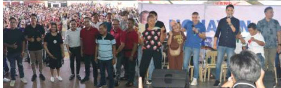
Ugnayan sa Barangay continues in Cavite province. Around of Cavite provincial government’s Ugnayan sa Barangay was held in Barangay Acacia 1 in Silang, Brgy. Julugan I in Tanza, and in the mu-