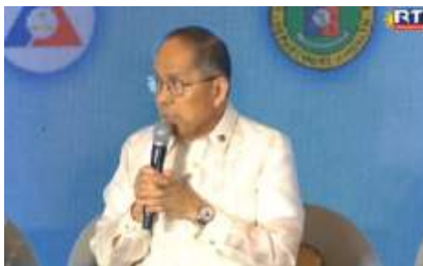
Labor Secretary Bienvenido Laguesma (File photo)

“May gawaing work from home, merong hindi. Hindi pwede work from home halimbawa ay (There are jobs where work from home is applicable, there are others where this is not applicable. An example of which is) embalmers. Pero iba pa din face to face, sana magtuloy tuloy (Of course,