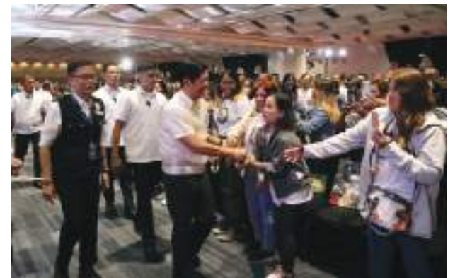
OFW FAMILY DAY. President Ferdinand R. Marcos Jr. on Wednesday (Dec. 20, 2023) shakes hands with overseas Filipino workers at the OFW Family Day 2023 at the SMX Convention Center in Pasay City. In his speech, Marcos acknowledged the sacrifices and contributions of OFWs.

He mentioned several programs for their reintegration, which include the Livelihood Development Assistance Program, the Balik Pinay Balik Hanapbuhay, the Financial Awareness Seminar-Small Business Management Training, the Enterprise Development Loan Program, and the Financial Assistance