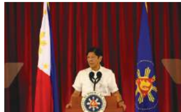
President Ferdinand R. Marcos Jr. (File photo)