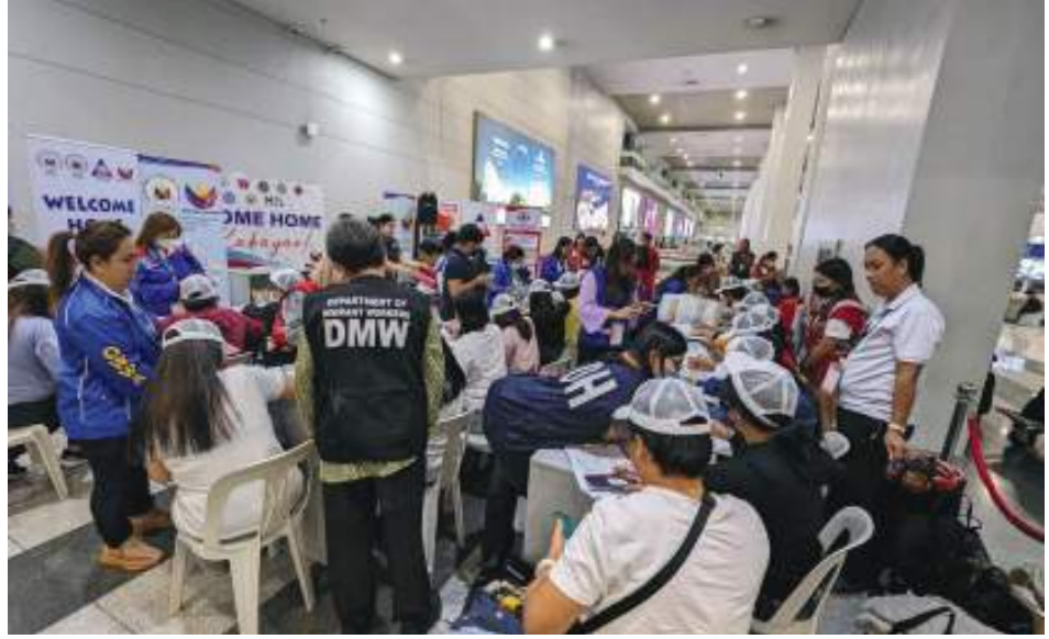
HOME FOR CHRISTMAS. The 11th batch of overseas Filipino workers (OFWs) from Israel arrive at the Ninoy Aquino International Airport Terminal 3 recently. The Department of Migrant Workers said the group is composed of 25 caregivers and two hotel workers.