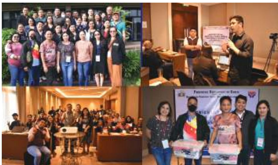
PGC Conducts Orientation on Handling Former Rebels and Former Violent Extremists

The Provincial Government of Cavite, through the Office of the Provincial Social Welfare and Development Officer spearheaded the Orientation on Handling Former Rebels (FRs) and Former Violent Extremists (FVEs) focused on their rehabilitation and reintegration. The activity also aimed to capacitate the frontline workers to effectively engage with these FRs and FVEs. The two-day event, held on November 23-24, 2023, at The Bayleaf Hotel in General Trias City, gathered key stakeholders to strategize and collaborate on addressing the challenges associated with the reintegration process.