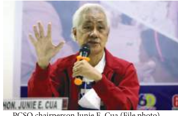
PCSO chairperson Junie E. Cua (File photo)

ang buong pamahalaan at buong bansa sa iba't-ibang aktibidad na isasagawa bilang komemorasyon linggong ito. Makakaasa po ang ating mga kababayang senior citizen na mananatiling top of mind ng PCSO ang kanilang ginhawa at kapakanan (We sup-