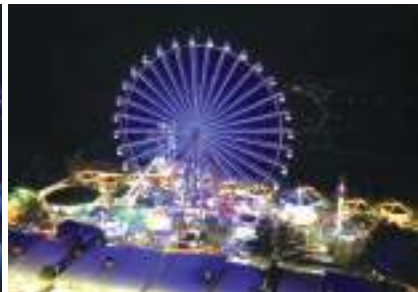
SM Mall of Asia