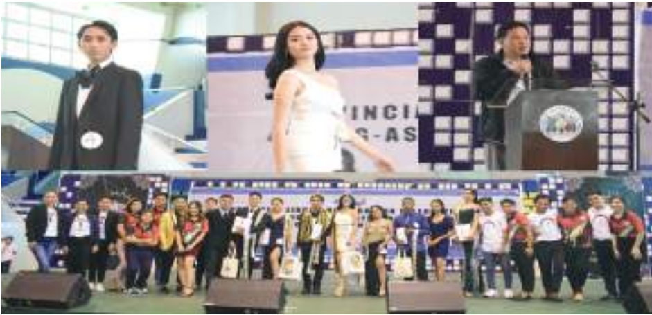
Celebrating youth excellence.

In pursuit of transformative change to improve the quality of life of the youth, the Office of the Provincial Social Welfare and Development Officer (OPSWDO) and the Pag-asa Youth Association of the Philippines, Inc. (PYAP) – Cavite, worked hand in hand in celebrating Linggo ng Kabataan at the Provincial Gymnasium, recently.