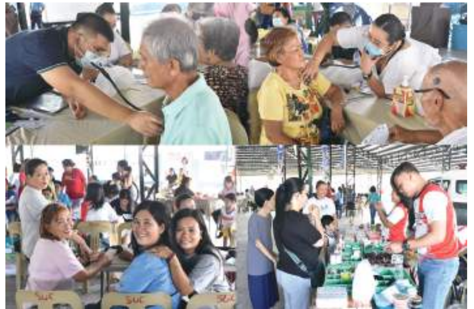
PGC's health outreach program serves Tanza locals.

To ensure everyone's safety, selected patients underwent screening and antigen swab testing before consultation. They also received mosquito repellent-lotion, as part of anti-dengue campaign program. - OPIO