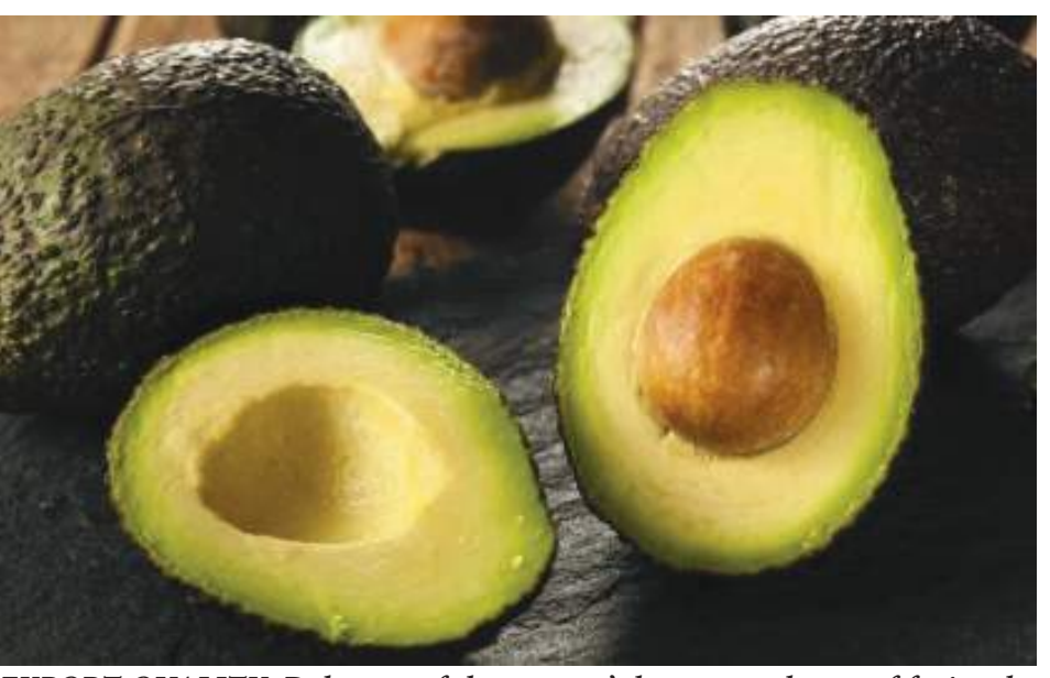
EXPORT QUALITY. Dole, one of the country's largest producers of fruits, describes their Hass avocado as creamy and smooth, with no bitter taste. The Korean government has approved the export of Philippine Hass avocado to South Korea, the Department of Foreign Affairs announced Tuesday (Sept. 12, 2023).