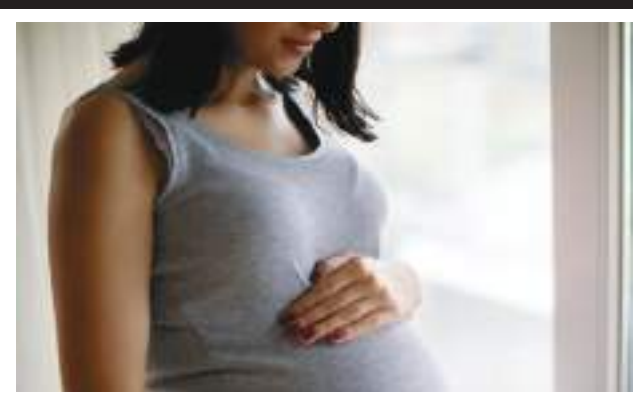
the Adolescent Preg- ter-Agency

The bill establishes nancy Prevention In-