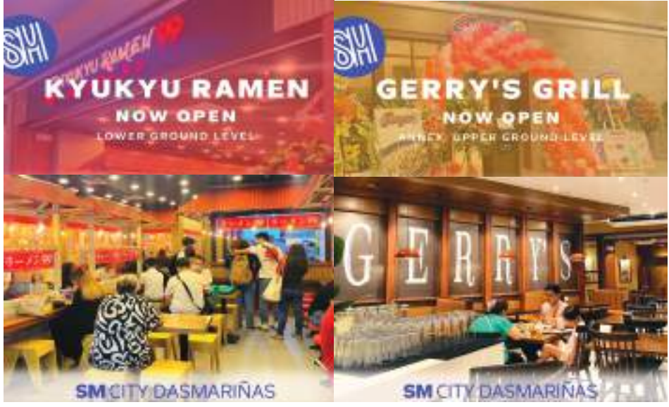
Enjoy new food hubs at SM City Dasmariñas

Ang taong masama ang puso ay hindi magtatagumpay, at ang nagsasalita ng panlilinlang ay mapapahamak. Kawikaan 17: 20