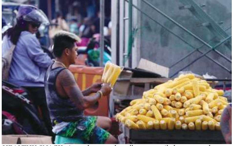
HEALTHY SNACK. A vendor repacks yellow corn piled on a wooden cart on Commonwealth Avenue, Quezon City recently. A three-piece pack sells between PHP30 and PHP40, depending on the size.

Earlier, the National Economic and Development Authority said the country has enough (Turn to p. 2)