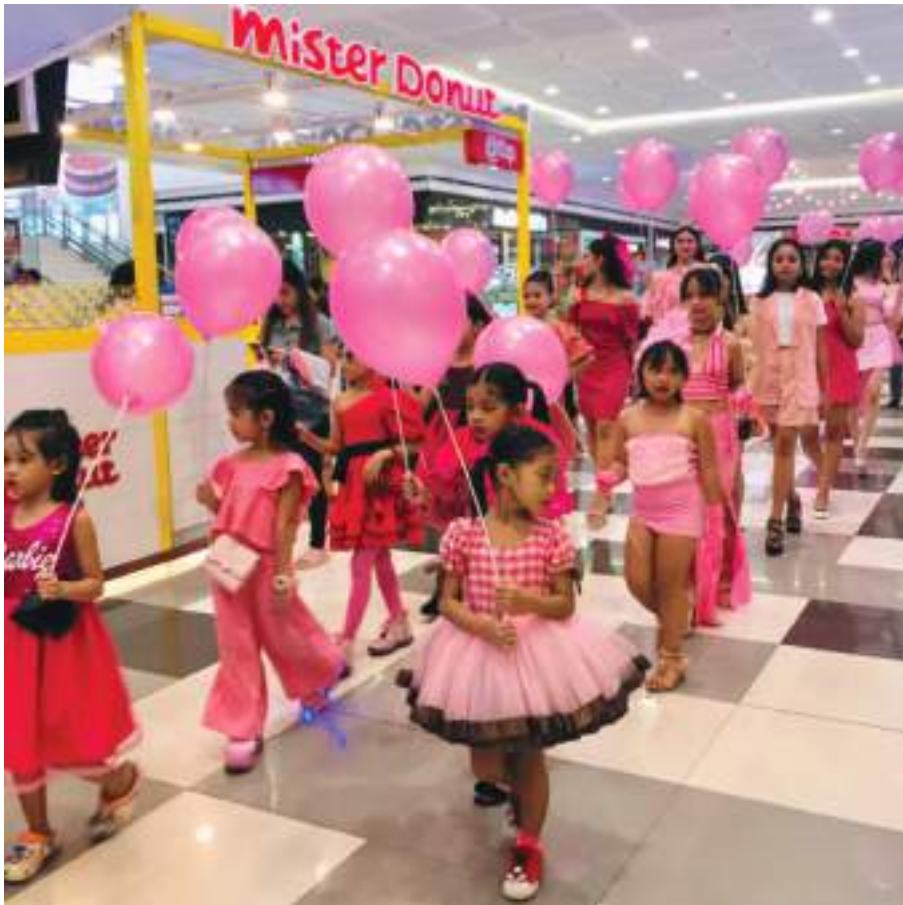
LITTLE BARBIE GIRLS PARADE AT SM CITY TRECE MARTIRES Wearing their Barbie-inspired outfit of the day, these cute little Barbie girls turned the mall into pink as they paraded in support of the Barbie Movie. Barbie the movie is still showing at SM Cinemas nationwide.