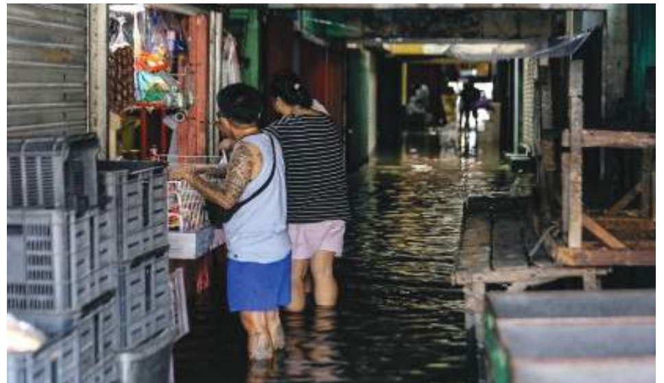
FLOODED. Residents buy goods from a stall inside the flooded Guagua Public Market in Pampanga recently. The National Disaster Risk Reduction and Management Council on Tuesday (Aug. 1, 2023) said the amount of damage to agriculture and infrastructure caused by the Typhoon Egay and the southwest monsoon has reached over PHP5.4 billion.

The Office of Civil Defense earlier said that the affected families are a combination of those displaced and those not needing transfer or removal (Turn to p. 2)