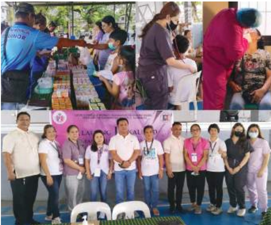
PGC extends Health care services to the locals of General Emilio Aguinaldo Three hundred eleven residents of General Emilio Aguinaldo benefitted from the free medical and dental services conducted by the provincial government of Cavite last July 25, 2023, bringing healing and hope to the constituents.