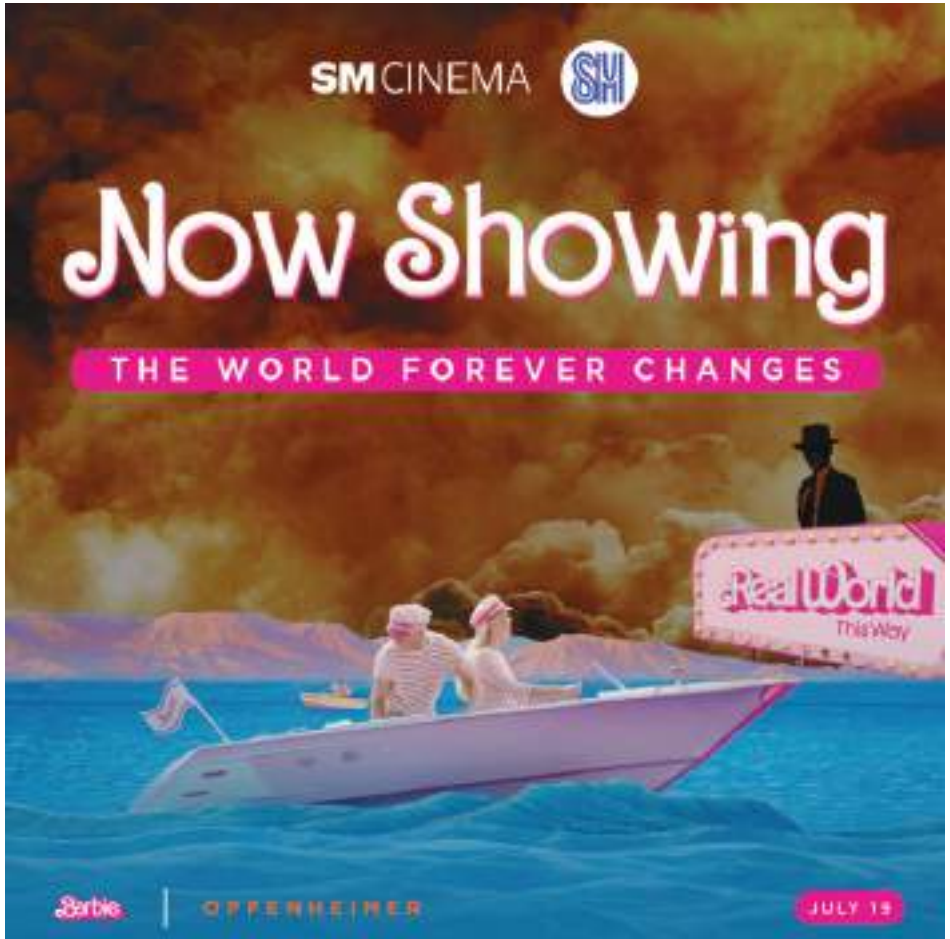
country, to the clearest digital surround sound system, surely you can bomb out stress with this epic movie date. So get your pink outfits prepped and your notes ready for a Barbieheimer date.BUY YOUR TICKETS NOW!